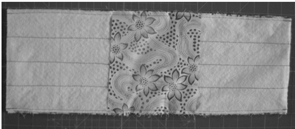
Pen Pocket Sewn In Place

Fold and then layer the inner lining piece then sew along both sides.